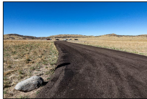
After Paved Driveway