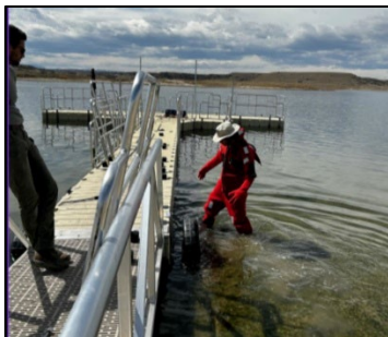
Dock Installation at Rueter-Hess

March brought its share of weather-related challenges as Rueter-Hess staff prepared for an early opening to watercraft. With temperature swings of more than 30 degrees, Rangers made the most of the mild days and worked diligently to set up amenities that will enhance the experience for water recreationists this season.