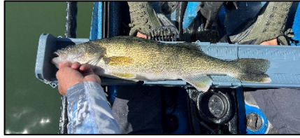
Walleye 24 Inches

commonly encountered from shore. Monitoring lure performance in relation to forage activity and habitat conditions continues to provide useful insights for angler success.