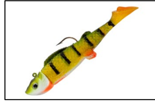
Yellow Perch Paddle Tail Lure