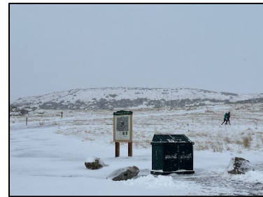
Winter Hiking at Rueter-Hess

After a largely dry winter, seasonal snowfall arrived just before spring. The wintry conditions did not deter trail users. The incline continues to offer a distinctive, conveniently located recreational opportunity that does not require extensive travel. Visitation in February increased by 37 percent, as community members and guests utilized 6.5 miles of scenic trails and the 132-step incline, which provides a 232-foot elevation gain.