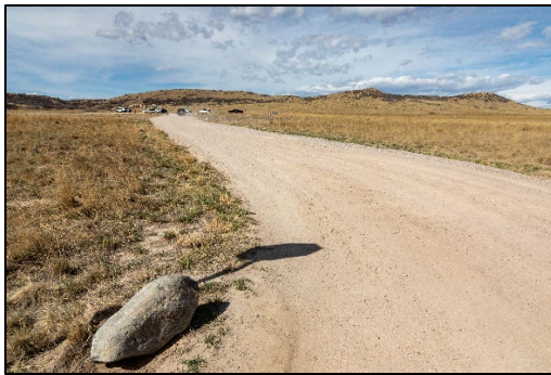
Before Dirt Driveway

Teamwork makes recreation improvements at the Rueter-Hess Incline trailhead possible. In early March, Parker Water, along with Douglas County's Departments of Parks and Recreation and Public Works, worked together to plan improvements to the Rueter-Hess Incline Challenge trailhead parking lot and access driveway. On March 30th and 31st, Public Works improved the 800-foot driveway with millings and repaired the one-acre parking lot.