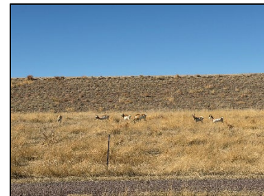
Pronghorn Herd at Rueter-Hess

On Wednesday, March 4th, a herd of 11 Pronghorn was spotted along the Percy-Hess trail at Rueter-Hess Reservoir. The herd was seen moving across open grassland habitat adjacent to the trail before continuing through the surrounding prairie landscape. These sightings highlight the importance of the reservoir property as an open habitat that supports native wildlife species.