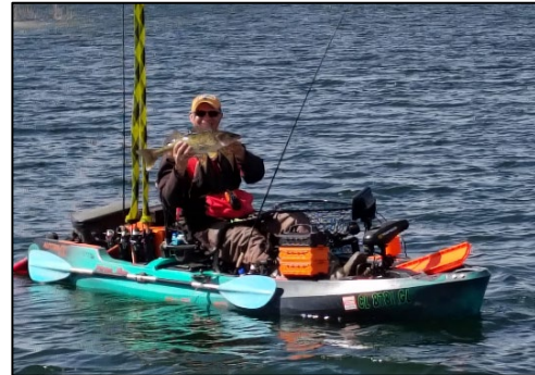
Angler at Rueter-Hess Reservoir March 2026

With word spreading quickly about the growing fishery at Rueter-Hess, activity on the water is already increasing. Rangers have prepared and launched the Safety Boat and are conducting regular fishing checks. More importantly, they continue to emphasize visitor safety by ensuring all boaters are properly wearing life jackets.