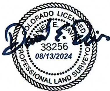
ILLUSTRATION ATTACHED AND MADE A PART HEREOF.