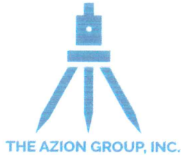
EXHIBIT 'A' ACCESS EASEMENT LEGAL DESCRIPTION